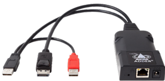
ADDERLink INFINITY 101T - DisplayPort™