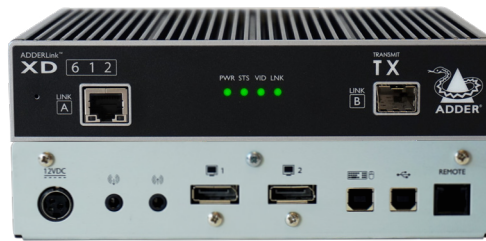
ADDERLink XD612 TX - Front & Rear