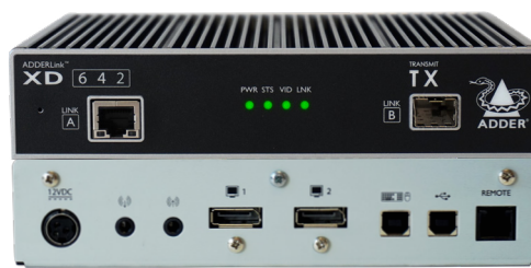
ADDERLink XD642 TX - Front & Rear