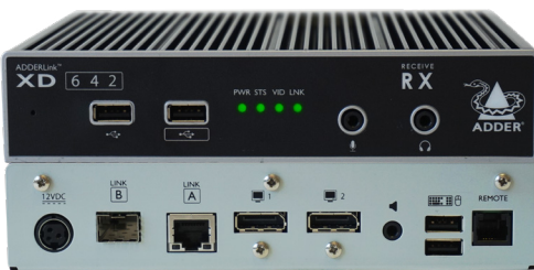
ADDERLink XD642 RX - Front & Rear

CAT6 is recommended for CATx extensions. CATx extensions are limited to 2 short patch connections. Patch cables should be CAT6 or better.