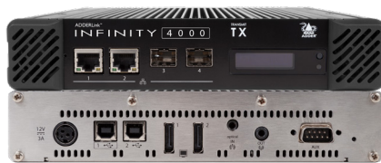
ALIF4000 TX - Front & Rear