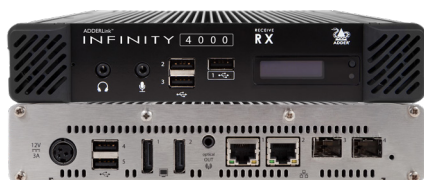
ALIF4000 RX - Front & Rear